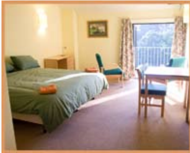
Room 1 (large bedroom)