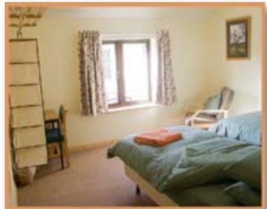
Room 4 (standard bedroom)