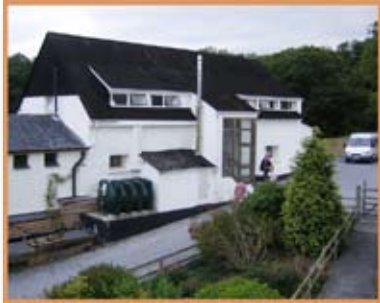
Rear of Long Barn