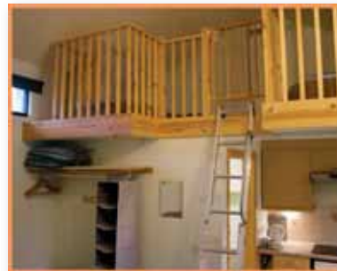
Sky cots (Berkshire & Gloucester)