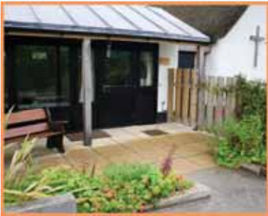
Pig Pen patio