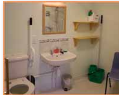
Wet room in Tamworth