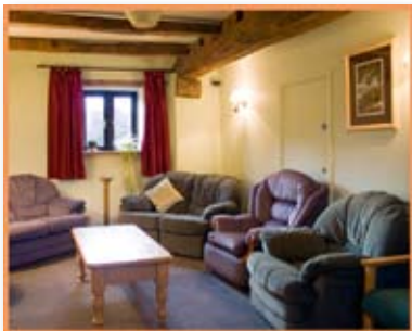
The Quiet Lounge