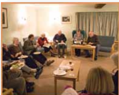
The Cider Press Lounge