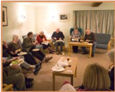
The Cider Press Lounge