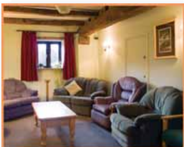
The Quiet Lounge