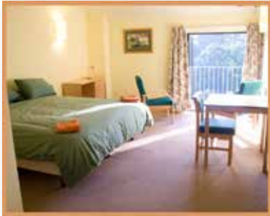
Room 1 (large bedroom)