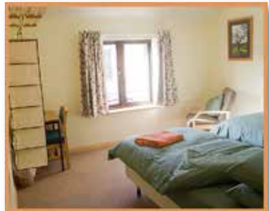
Room 4 (standard bedroom)